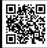
Cajo Vega™ Presentation